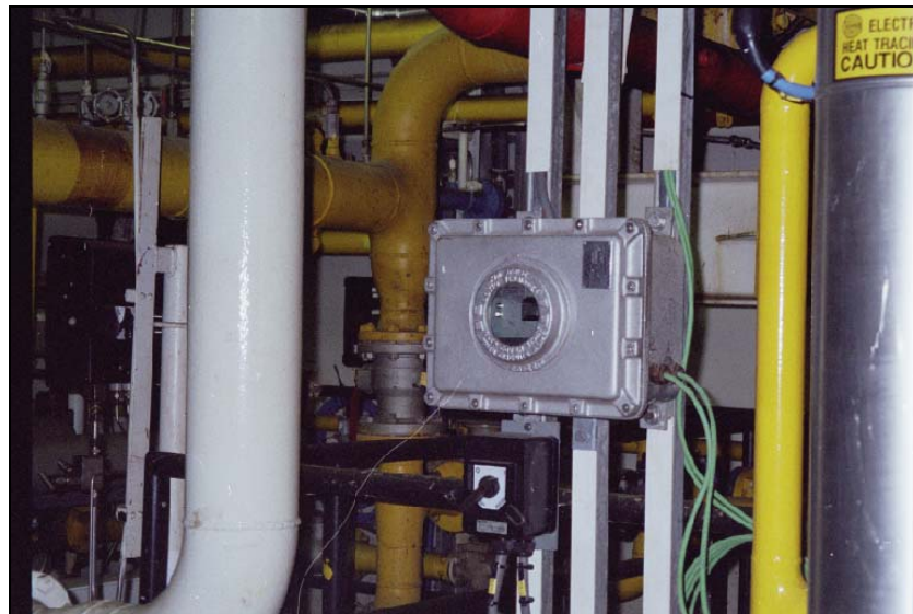
Enclosure type: Exx

This model is optional for all Industrial units up to 8"